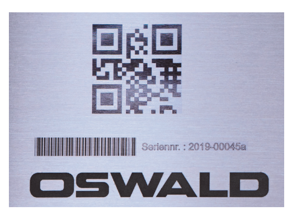
Marking example on VA-steel